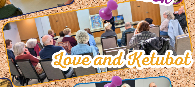
Love and Ketubot