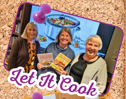
Let It Cook