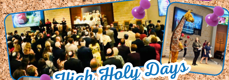
High Holy Days 2025