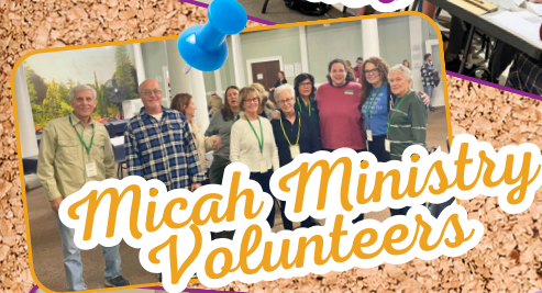
Micah Ministry Volunteers