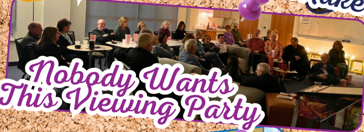
Nobody Wants This Viewing Party