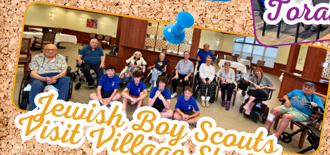
Jewish Boy Scouts Visit Village Shalom