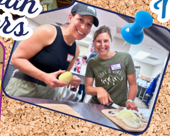
Girls' Night Out